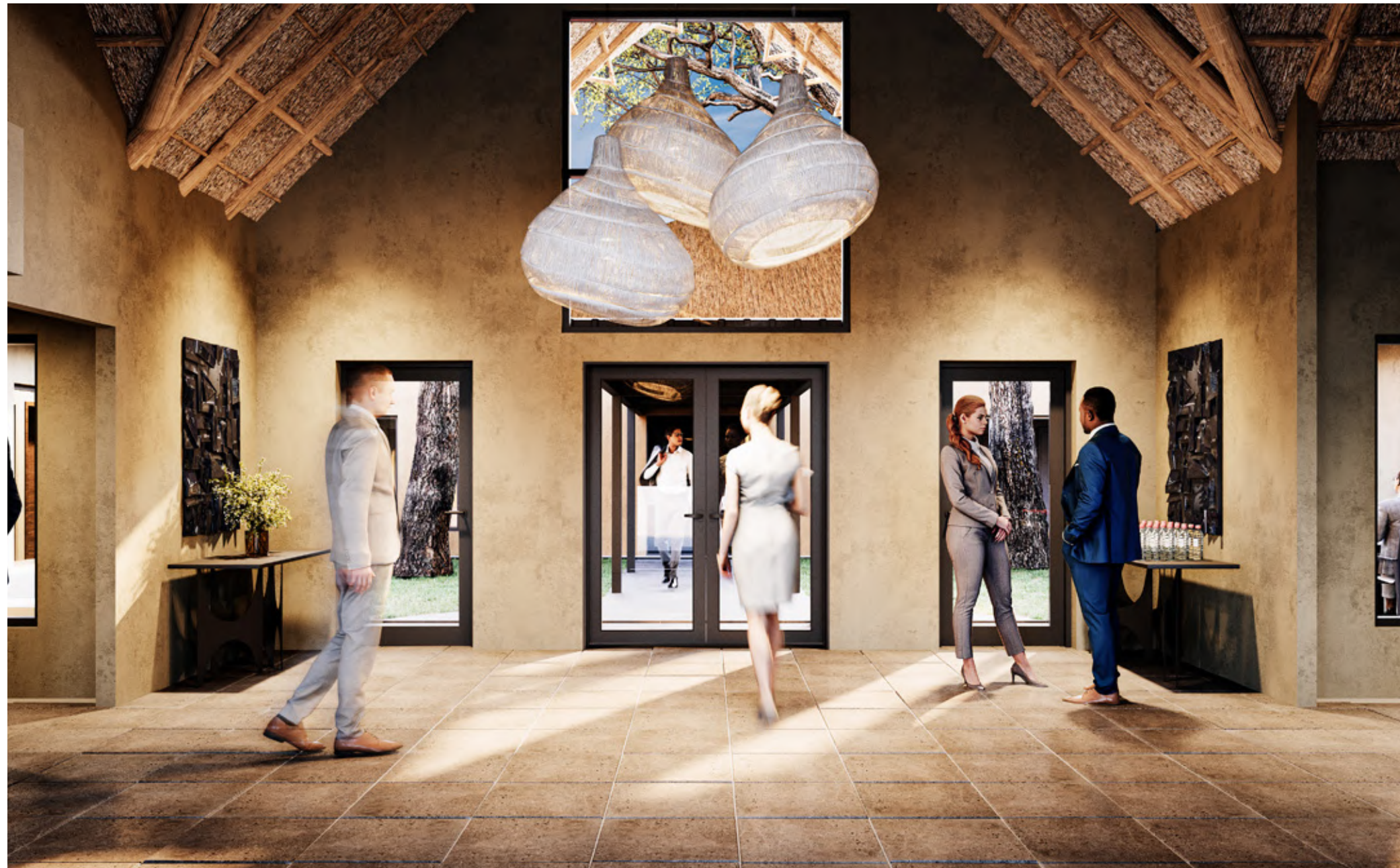
BABOHI AT QWABI PRIVATE GAME RESERVE BY NEWMARK

More than a traditional conferencing venue, the Qwabi Conference Centre has been designed as an immersive bushveld destination where business, celebration and contemporary African hospitality come together in a setting shaped by nature.